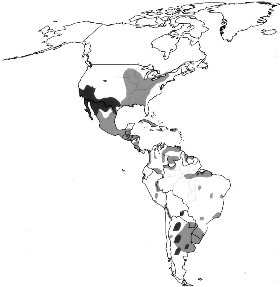
Figure 2. Geographic distribution of Histoplasma capsulatum (gray) and Coccidioides immitis (black) infections in the Americas (subject to limitations of surveillance and reporting). Although C. immitis is restricted in distribution to the Americas, infections due to H. capsulatum have been reported from parts of southern and eastern Europe, parts of Africa, eastern Asia, and Australia [5]; however, these reports are usually limited to a single or a few cases that often have no clear source of exposure, and no outbreaks have been reported outside the Americas, which makes it very difficult to accurately map the worldwide distribution of this infection.

tantly, individuals can be reinfected with H. capsulatum with sufficient exposure, and, in these individuals, the incubation period can be shorter.